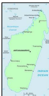
Carte de Madagascar

Our goal is to promote the Malagasy PAVs or Value-Added Plants.